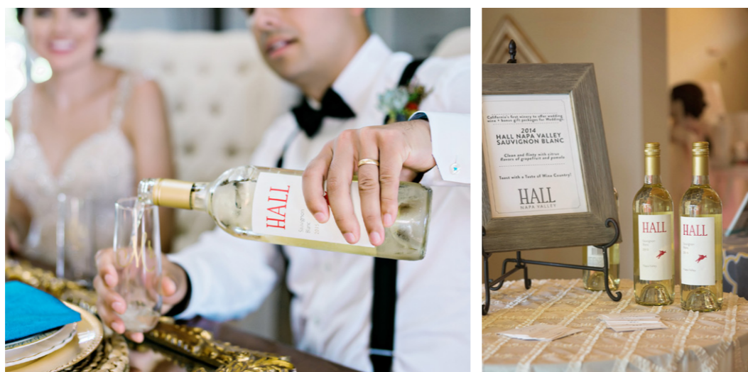
2016 National Sponsor: HALL Wine

Former National Partners include BRIDES Magazine, HALL Wine, Social Sparkling Wine, Shane & Co. Jewelry, and more. Collectively, our vendors have the unique opportunity to meet thousands of brides every year, but if you're dreaming of something bigger, we'd love to dream with you!