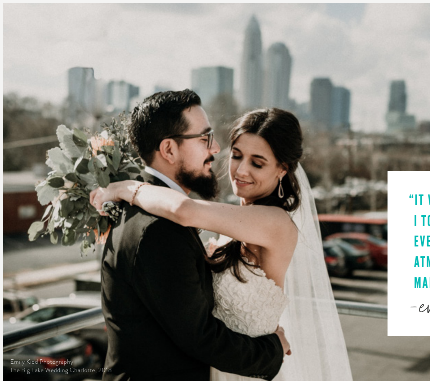
The Big Fake Wedding Charlotte, 2018

ATTRACTING OVER 5,000 ATTENDEES AND 900 VENDORS ANNUALLY ACROSS 30+ EVENTS IN OVER 20 CITIES.