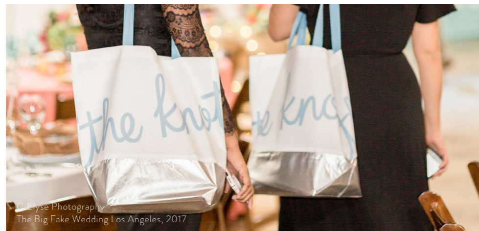
The Big Fake Wedding Los Angeles, 2017

We've connected with hundreds of wedding vendors and media partners over the years, so whether you need industry connections or an experienced team to coordinate a unique styled shoot, we're your people.