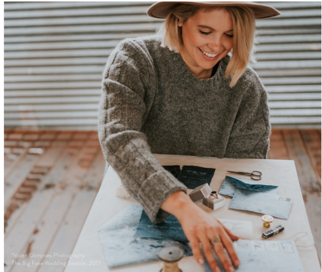
The Big Fake Wedding Seattle, 2017

WHATEVER YOUR BUDGET, WE HAVE AN OPTION FOR YOU.