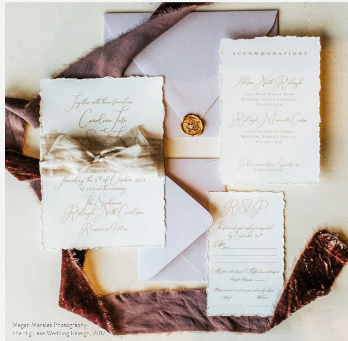
The Big Fake Wedding Raleigh, 2017

“IT WAS A WONDERFUL AND CREATIVE EXPERIENCE. I TOLD EVERYONE I KNEW! I LOVED BEING ABLE TO SEE EVERYTHING ‘IN ACTION.’ FUN DRINKS AND A CASUAL ATMOSPHERE MADE IT EASY TO TALK TO VENDORS (AND MADE IT EASIER TO CONVINCE MY FIANCE TO JOIN ME!).”