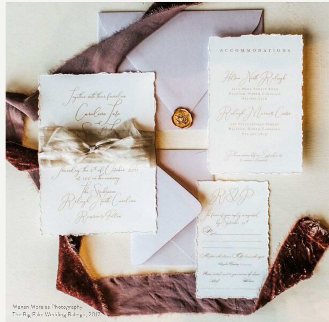
The Big Fake Wedding Raleigh, 2017

“IT WAS A WONDERFUL AND CREATIVE EXPERIENCE. I TOLD EVERYONE I KNEW! I LOVED BEING ABLE TO SEE EVERYTHING ‘IN ACTION.’ FUN DRINKS AND A CASUAL ATMOSPHERE MADE IT EASY TO TALK TO VENDORS (AND MADE IT EASIER TO CONVINCE MY FIANCE TO JOIN ME!).”