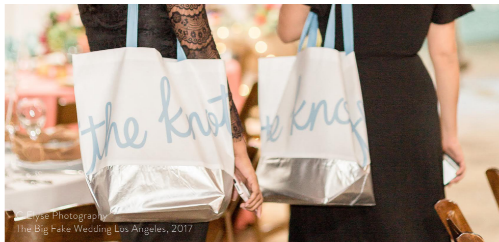
The Big Fake Wedding Los Angeles, 2017

We've connected with hundreds of wedding vendors and media partners over the years, so whether you need industry connections or an experienced team to coordinate a unique styled shoot, we're your people.