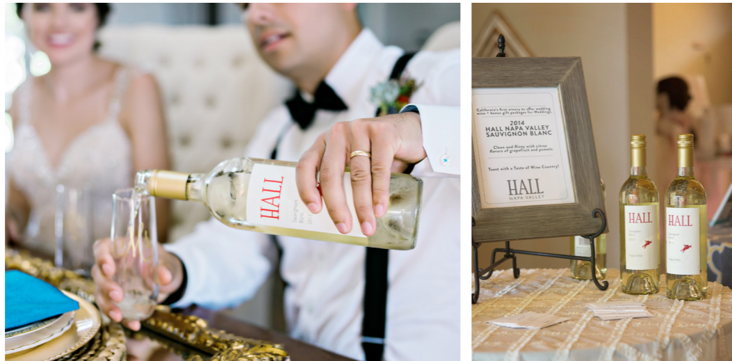
2016 National Sponsor: HALL Wine

Former National Partners include BRIDES Magazine, HALL Wine, Social Sparkling Wine, Shane & Co. Jewelry, and more. Collectively, our vendors have the unique opportunity to meet thousands of brides every year, but if you're dreaming of something bigger, we'd love to dream with you!