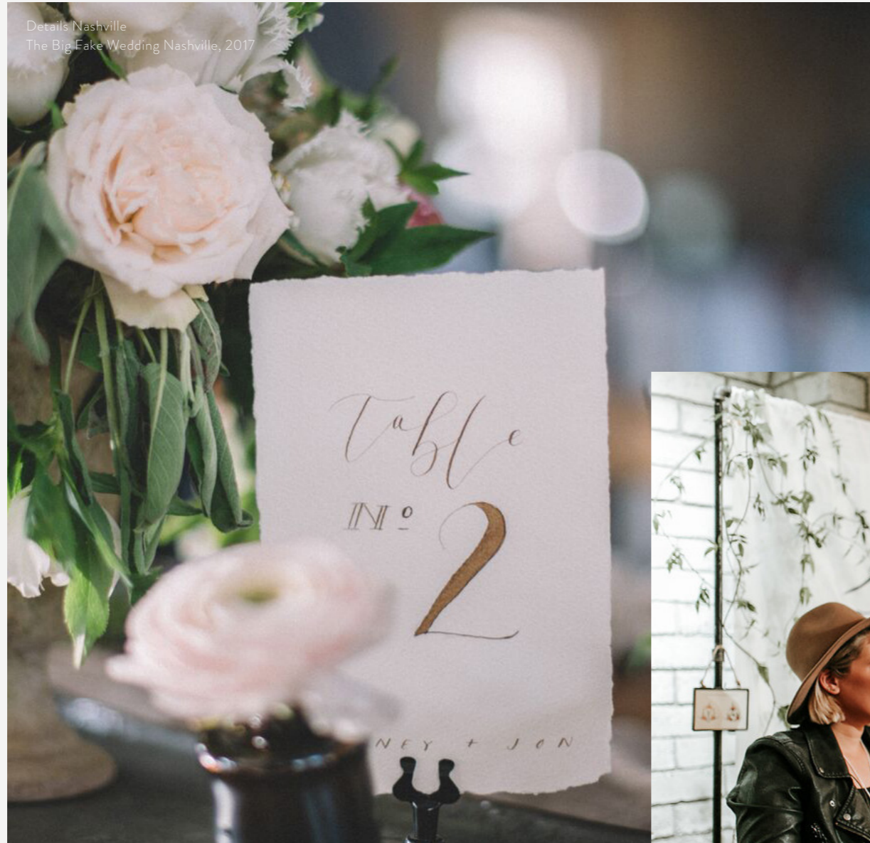
Details Nashville The Big Fake Wedding Nashville, 2017