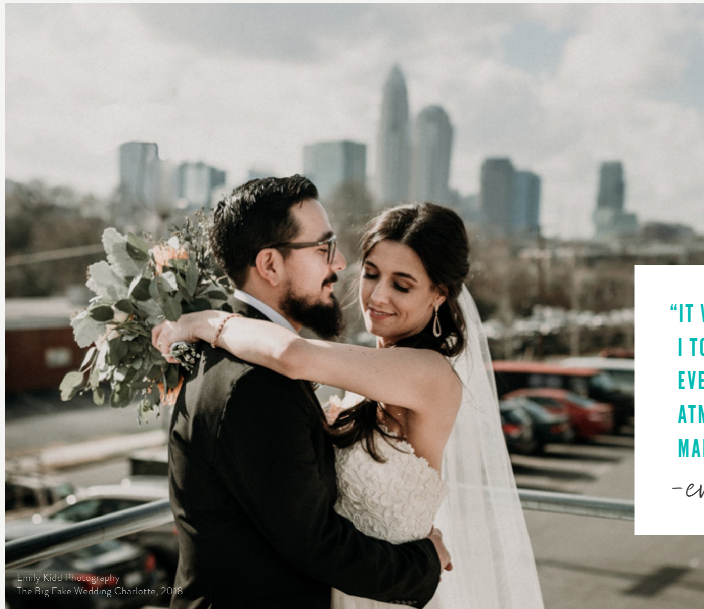
The Big Fake Wedding Charlotte, 2018

ATTRACTING OVER 5,000 ATTENDEES AND 900 VENDORS ANNUALLY ACROSS 20+ EVENTS IN 16 CITIES.