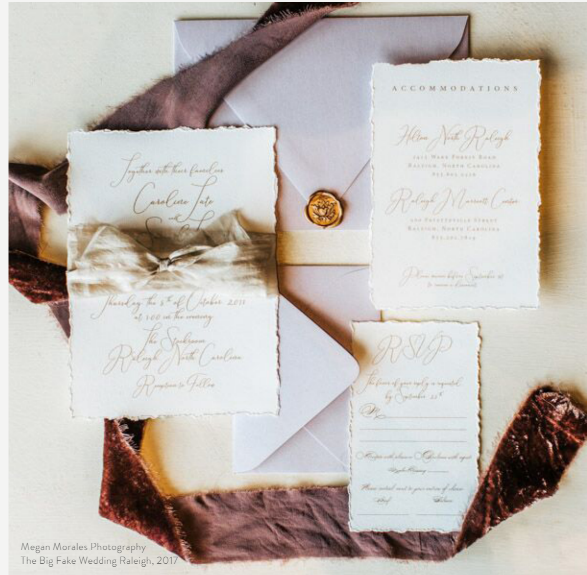
The Big Fake Wedding Raleigh, 2017

“IT WAS A WONDERFUL AND CREATIVE EXPERIENCE. I TOLD EVERYONE I KNEW! I LOVED BEING ABLE TO SEE EVERYTHING ‘IN ACTION.’ FUN DRINKS AND A CASUAL ATMOSPHERE MADE IT EASY TO TALK TO VENDORS (AND MADE IT EASIER TO CONVINCING MY FIANCE TO JOIN ME!).”